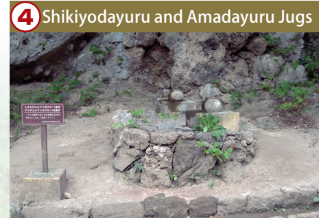
4 Shikiyodayuru and Amadayuru Jugs

The two jugs are placed to collect the "holy water" dripping from the two stalactites above.