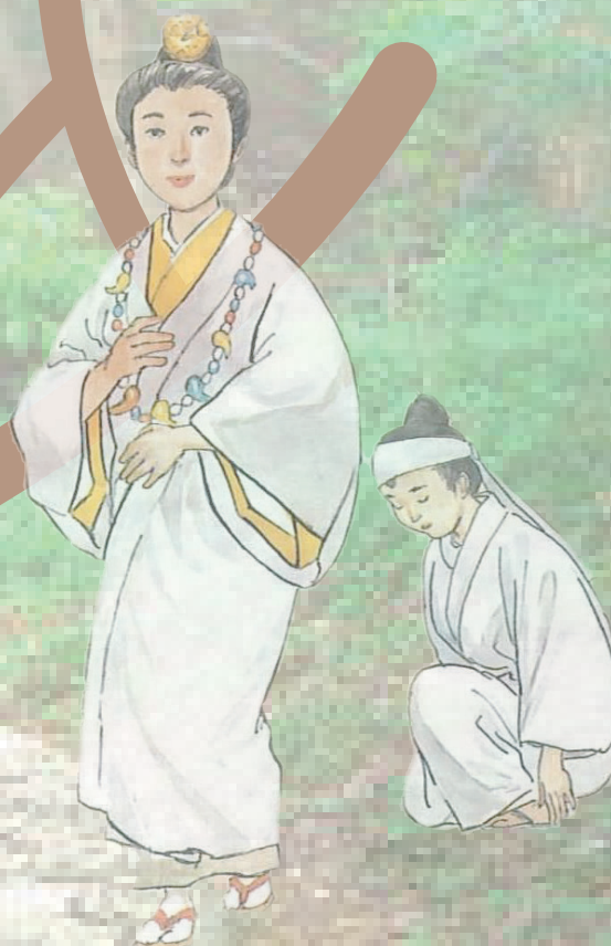
Gusuku Sites and Related Properties of the Kingdom of Ryukyu