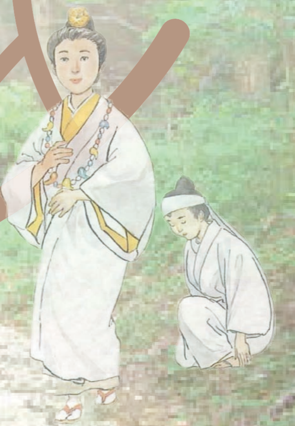
Gusuku Sites and Related Properties of the Kingdom of Ryukyu