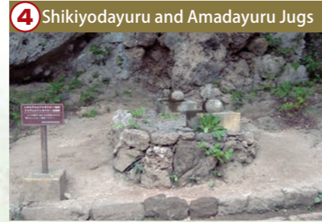
4 Shikiyodayuru and Amadayuru Jugs

The two jugs are placed to collect the "holy water" dripping from the two stalactites above.